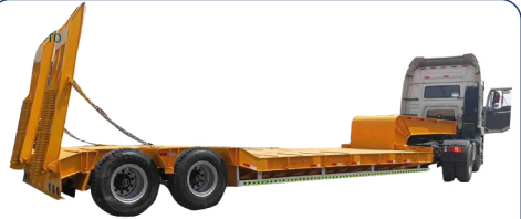
LOW BED TRAILER