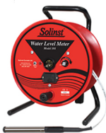
WATER LEVEL METERS