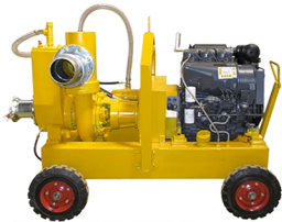
DEWATERING DIESEL PUMPS