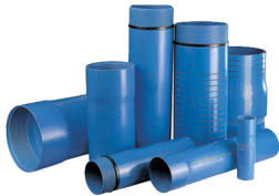
UPVC SCREEN CASING